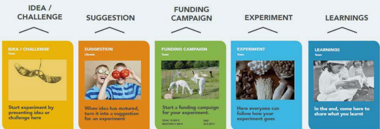
Figure 3.10: Place to Experiment process

Furthermore, the rapidity with which the tool was created means that a number of issues are still open for discussion. Most crucially, there is still some debate regarding who will evaluate the experiments and how best to manage the provision of capacity building. Additionally, the Government of Finland must decide how best to ensure continued political support and buy-in after the remaining two years of its mandate, so as to ensure sustainability.