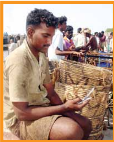
Fisherman in Tamil Nadu