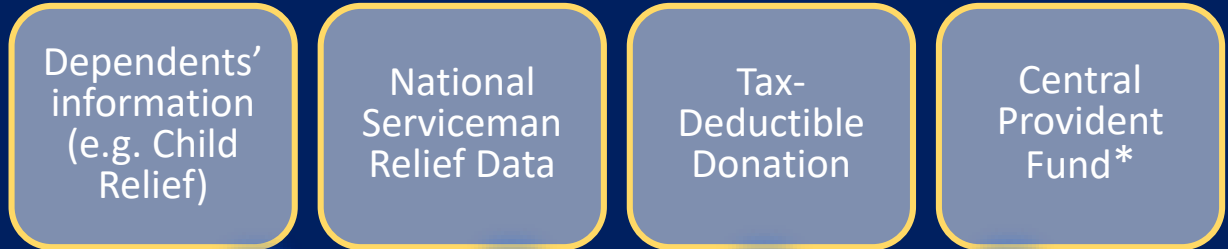
Illustration: Data received from other agencies and partners:

* Compulsory comprehensive savings and pension plan for Singaporeans & permanent residents