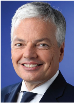
Mr Didier Reynders, Deputy Prime Minister and Minister of Foreign Affairs and European Affairs, Kingdom of Belgium

Didier Reynders obtained a degree in law at the University of Liège in 1981. In 1985, he was appointed Director General of the Local Authorities Department of the Ministry of the Walloon Region. From 1987-1988, he was the Chief of Staff of the Deputy Prime Minister, Minister of Justice and Institutional Reforms, Mr Jean Gol. Mr Reynders was Chairman of the Société Nationale des Chemins de fer belges (1986-1991), of the National Society of Airways (1991-1993), and of the Board of Directors of the SEFB Record Bank (1992-1999). Simultaneously, he pursued a political career in the PRL (Liberal Party): he was elected a member of the Liège Municipal Council in 1988, and has been the leader of the PRL group there since early 1995. King Albert II appointed him Minister of Finance in 1999, Deputy Prime Minister in 2004, and Deputy Prime Minister, in charge of the National Lottery, the Federal Holding and Investment Company and the insurance companies in 2007. He was Minister of Foreign Affairs, Foreign Trade and European Affairs from 2011-2014, and became Minister of Foreign Affairs and European Affairs, in charge of Beliris and Federal Cultural Institutions on 11 October 2014.