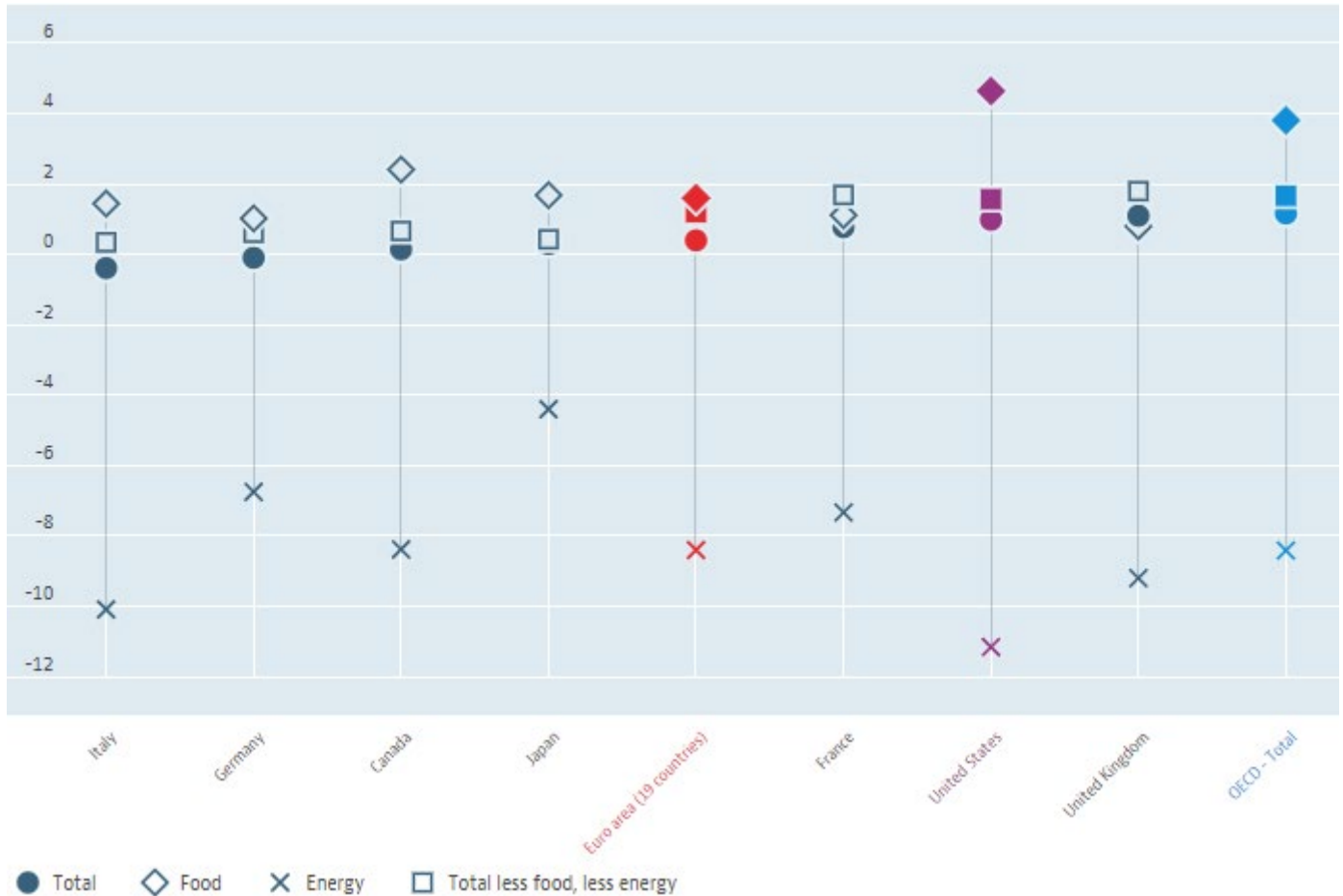
Graph 1 - Consumer prices, selected areas July 2020, percentage change on the same period of the previous year, %

Visit the interactive OECD Data Portal to explore these data further