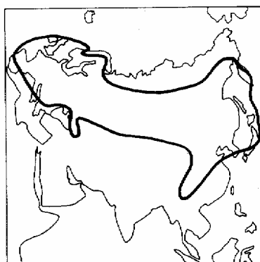
Figure 2. The natural distribution of Betula pendula (Hämet-Ahti et al. 1992).

30. The northern limit of the range of silver birch appears to be determined by protection from cold north-easterly winds. The southern limits approximate to the line of an average of 10 mm July rainfall (Atkinson 1992). There are different views of the eastern limit of the range, 60° by Jalas & Suominen (1976) and 103° by Hämet-Ahti et al. (1992).