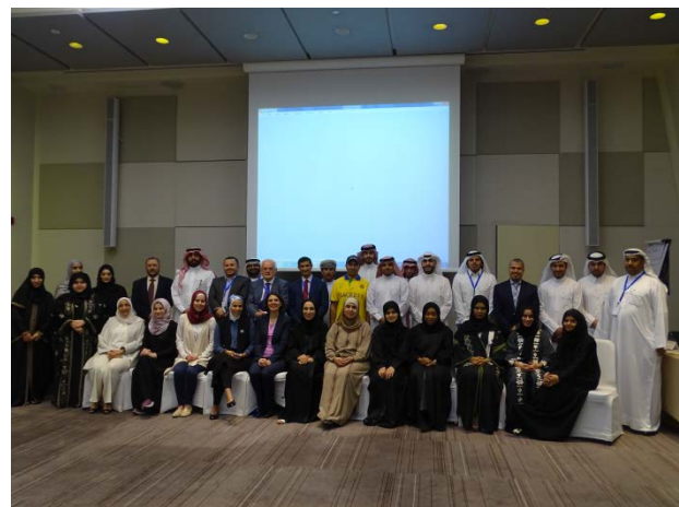
Capacity building seminar for countries of the Gulf Cooperation Council, 24 -26 October 2016 in Dubai

RIA is highly relevant for standardisation organisations as it helps consider the potential of "alternatives to regulation" as other ways to reach the substantive policy objectives that an agency or ministry is pursuing. Among these alternatives, standards occupy a key position as they can greatly contribute to an efficient business regulatory environment.