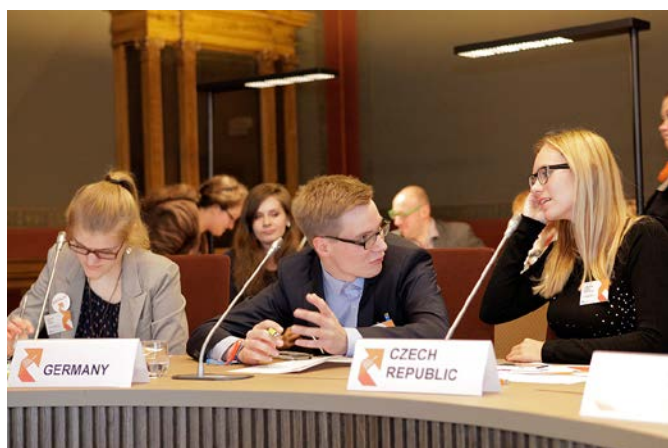
Students from Germany and Czech Republic engage in discussions at the Youth Dialogue in Helsinki, on 27 October.

During yesterday's Youth Dialogue we were called to ensure access and space for youth to truly influence decision-making at the national, regional and local levels, to listen to youth, and to support multiple channels and institutions for them to translate engagement into action.