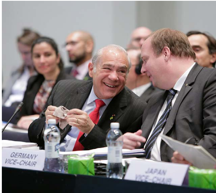
Mr. Angel Gurría , OECD Secretary-General and Mr. Helge Braun , Minister of State to the Federal Chancellor, Germany, Vice Chair