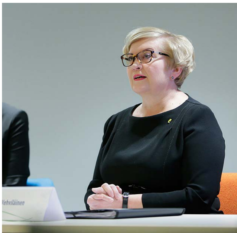
Ms. Anu Vehviläinen , Minister of Local Government and Public Reforms, Finland, Chair