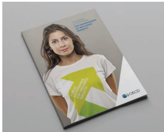
The Governance of Inclusive Growth, OECD, 2015

Ultimately, this will require a change in the culture of the public sector going beyond technical efficiency to the creation of public value where the civil service aims to deliver better services to all and strengthen the legitimacy of, and confidence in, public sector institutions in the eyes of the public.