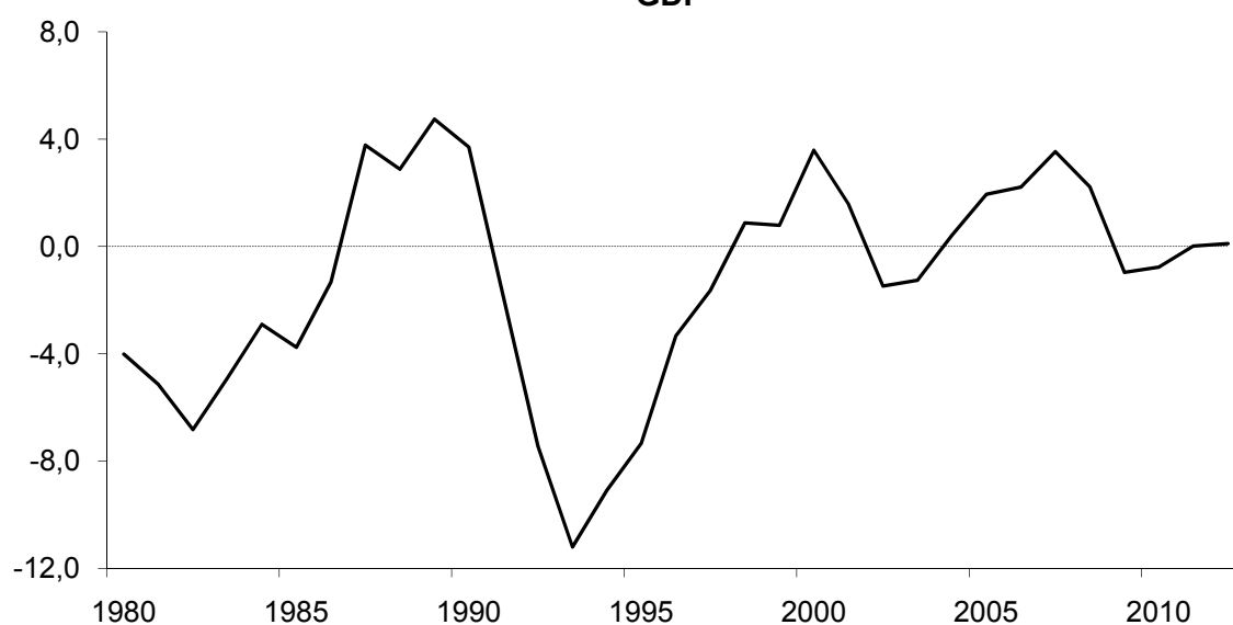
Figure 3 General government net lending in Sweden, per cent of GDP