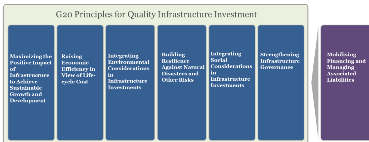
Figure 1. Structure of the Compendium

financial resources to support the delivery of quality infrastructure investment, particularly at scale, and in light of considerable OECD guidance in this area (Figure 1).