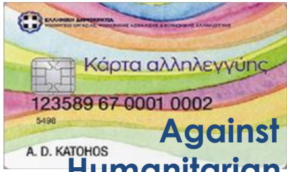
Against Humanitarian Crisis Measures 2015

Free transportation for the unemployed 2015