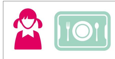
School Meals 2017