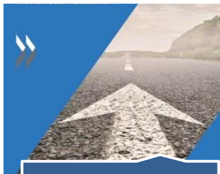
The Welsh Education Reform Journey (2017)

Our most recent work has consisted in tailored country reviews with an implementation focus, and related policy support activities in the form of Policy Assessments, Strategic Advice and Implementation Seminars. All publications for previous work are available on OECD iLibrary ( https://www.oecd-ilibrary.org/ ) or upon request.