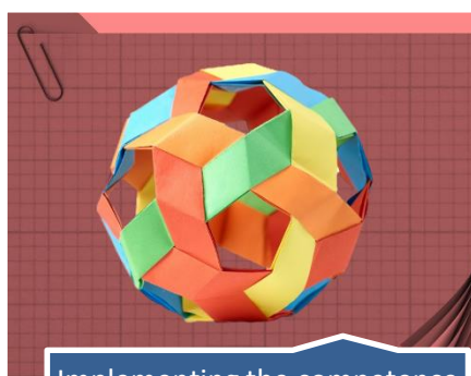
Implementing the competence development model for schools in Norway (2018-19)