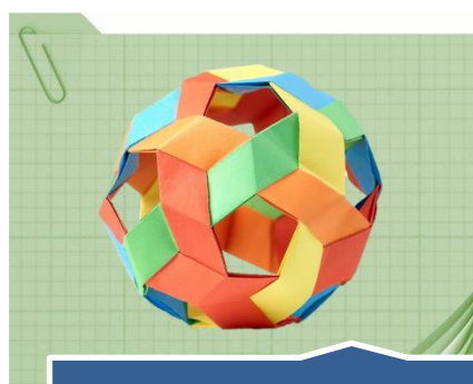
Reviewing the Senior Cycle in Ireland (2018-2019)