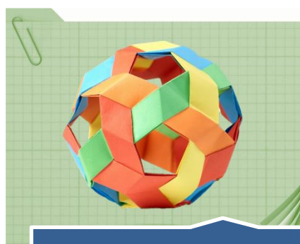
Reviewing the Senior Cycle in Ireland (2018-2019)