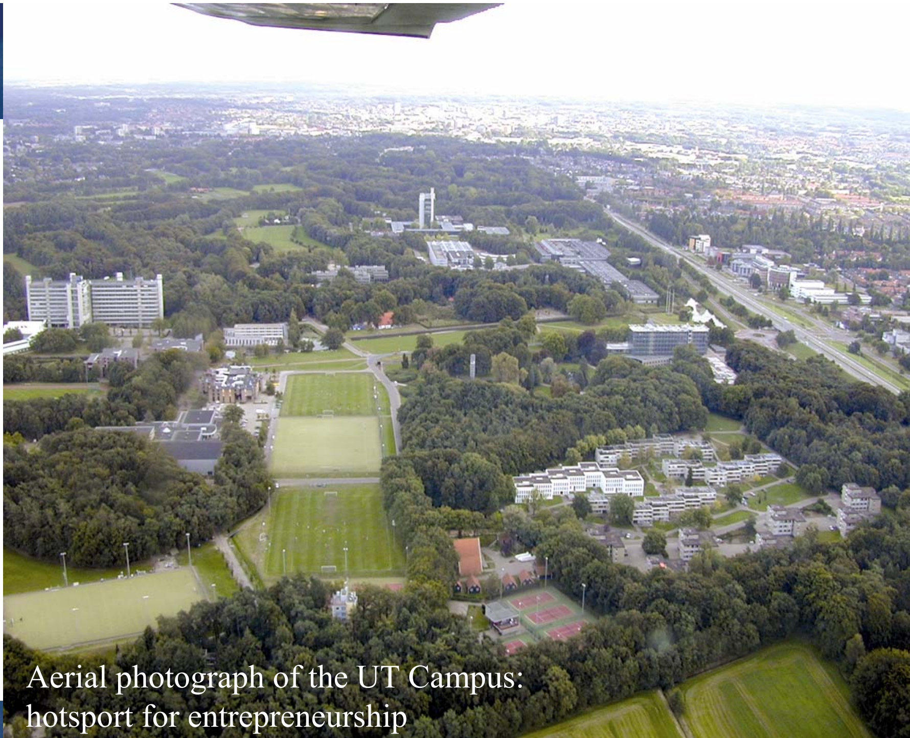
Aerial photograph of the UT Campus: hotspot for entrepreneurship