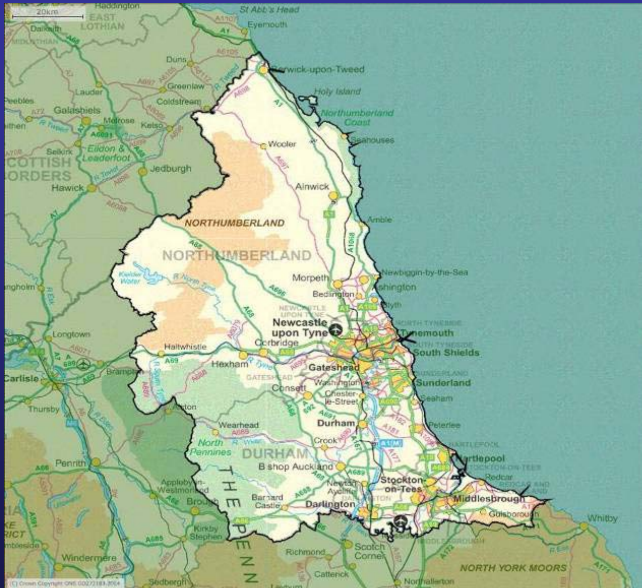
Durham, Northumbria and Teesside Universities, OECD/IMHE Conference, Copenhagen, 16 October 2006