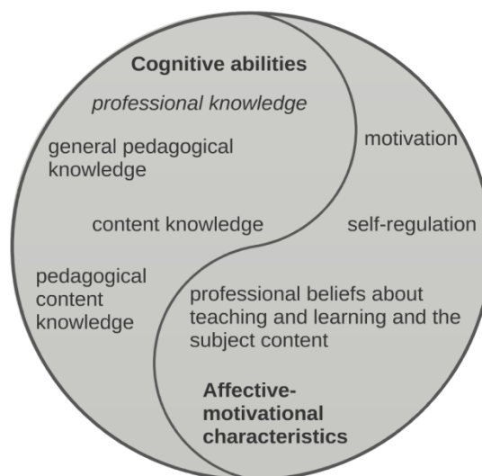
Figure 1: Professional competence of teachers Adapted from Blömeke and Delaney (2012)

While teacher knowledge is certainly a component of teacher professionalism, professional competence involves more than just knowledge. Skills, attitudes, and motivational variables also contribute to the mastery of teaching and learning. Blömeke and Delaney (2012) proposed a model that identifies cognitive abilities and affective-motivational characteristics as the two main components of teachers’ professional competence (see Figure 1).