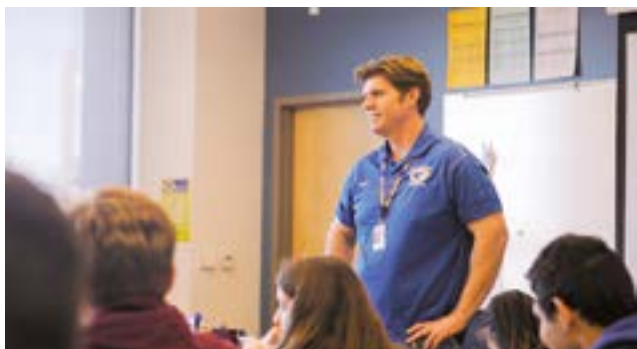
Socioemotional Learning, USA, Facebook and Yale Center for Emotional Intelligence