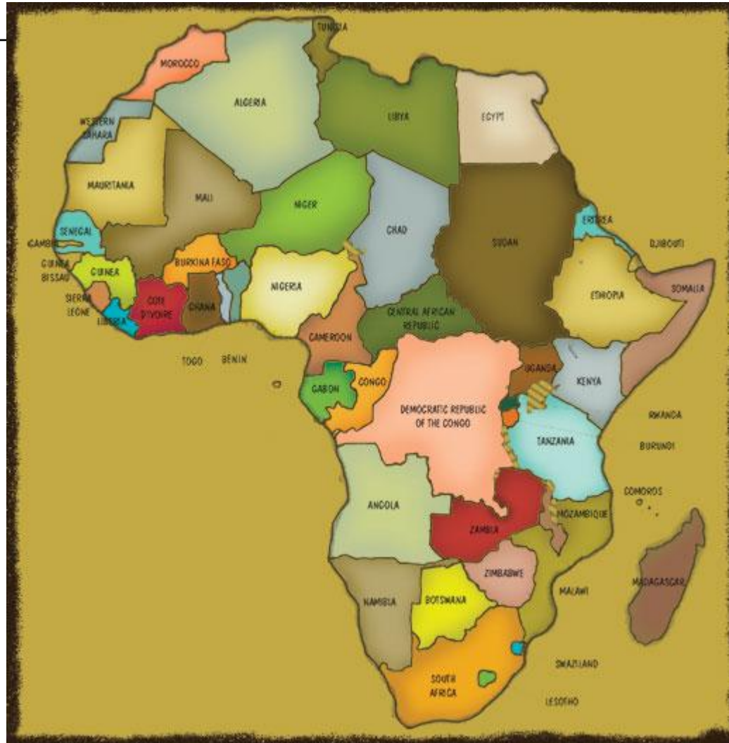
4th OECD Forum on African Public Debt Management