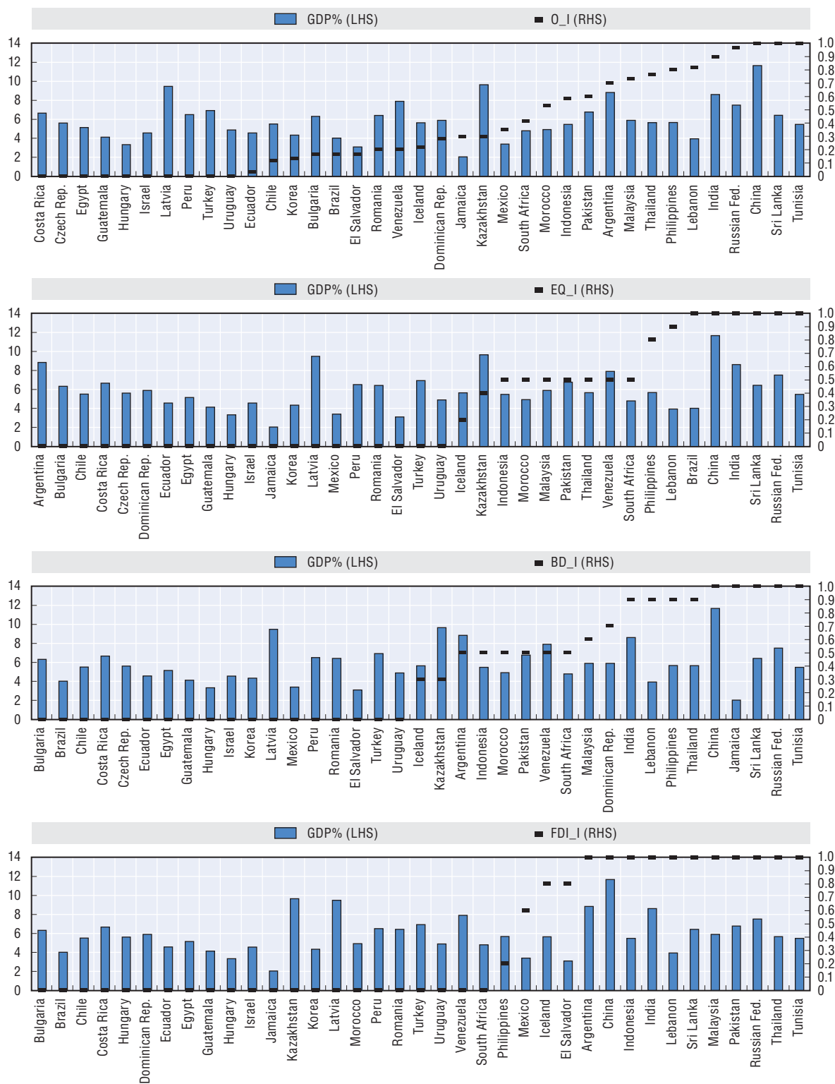
Figure 2. Annual real GDP growth rate and capital control indices

Note: All figures are averaged over the period 2003-09.