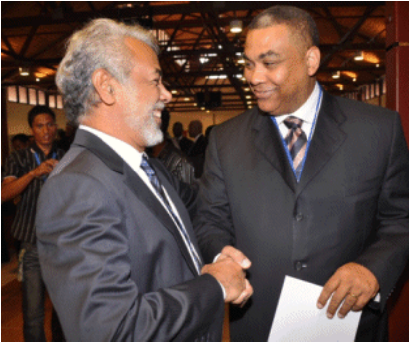
The Prime Minister of Timor-Leste, Kay Rala Xanana Gusmão, and the Minister of Planning of the Democratic Republic of the Congo, Olivier Kamitatu Etsu, at the Dili International Dialogue, 10 April.

The g7+ meeting helped set the stage for the Dili International Dialogue on Peacebuilding and Statebuilding (9-10 April), where participants exchanged experiences on dealing with conflict and explored methods of developing capable, accountable and responsive states. "Building capacity is not one-size-fits-all," said Natty Davis, Minister of State in Liberia. "States themselves need to begin to define some of their own priorities."