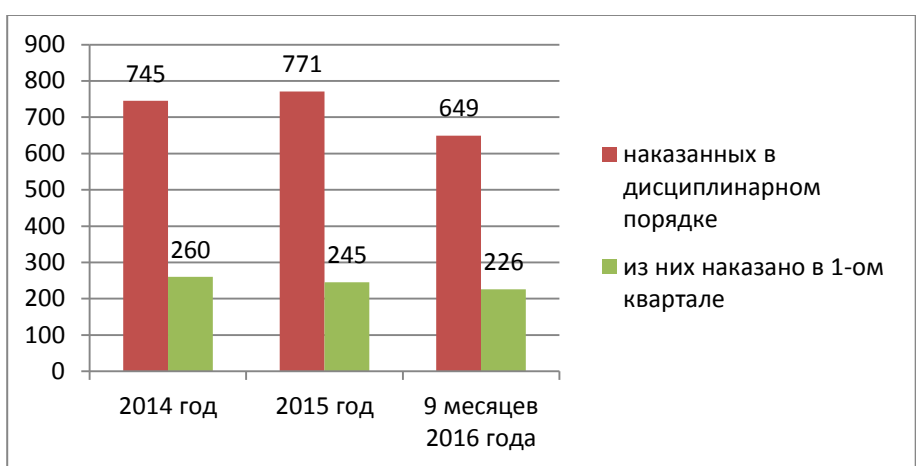
Figure 2. Statistics of disciplinary sanctions against prosecutors