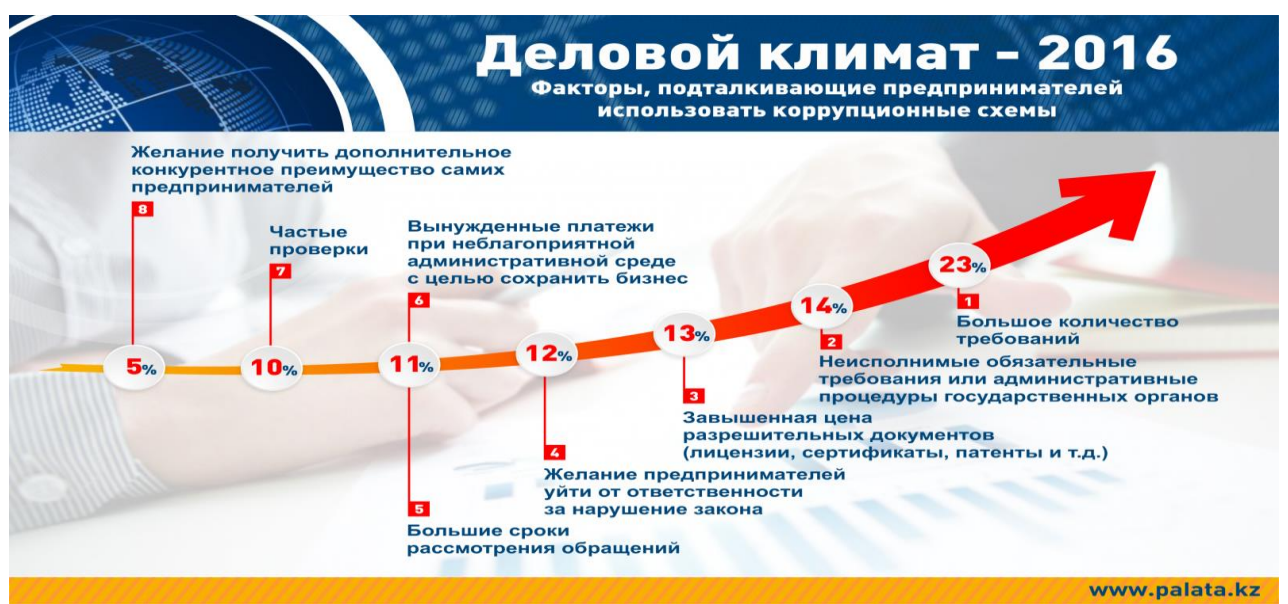
Figure 1. Factors encouraging entrepreneurs to rely on corrupt schemes

payments in an unfavourable administrative environment in an attempt to save business; frequent inspections; and the desire of entrepreneurs themselves to gain an added competitive advantage.<sup>6</sup>