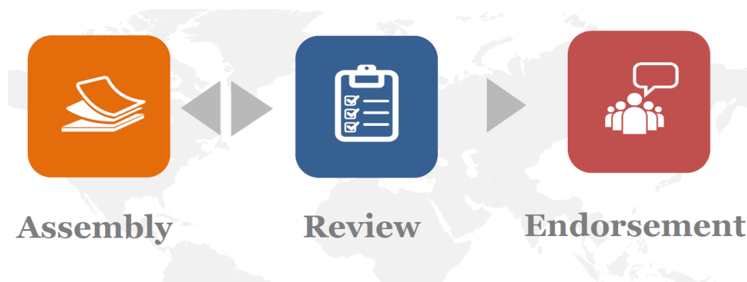
Figure 3.1. The three phases of the AOP development process