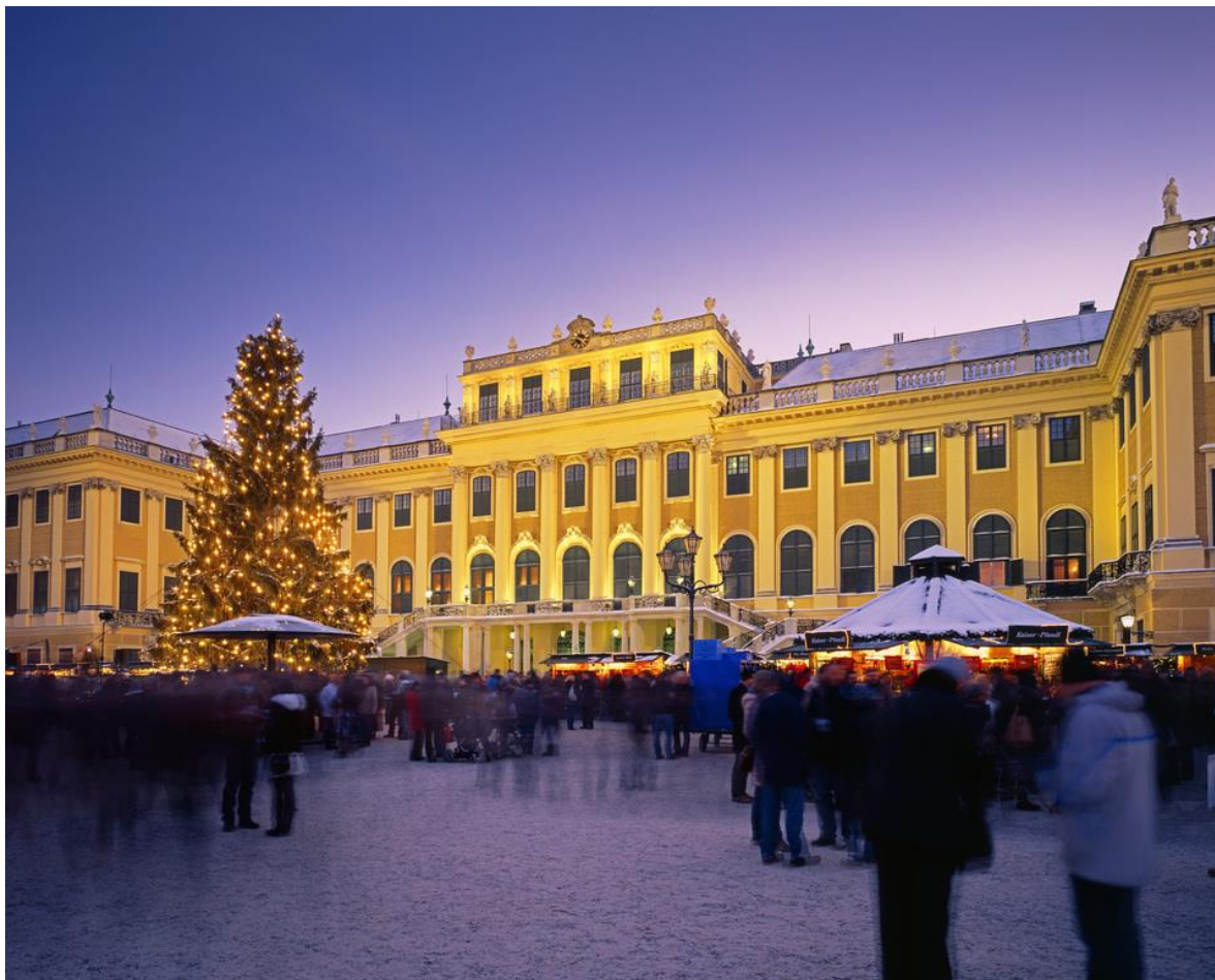
Vienna Christmas Market at Schönbrunn Palace