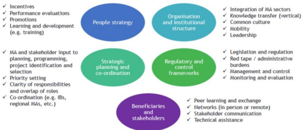
Figure 3. Example of table themes and identified issues for an ACB workshop

Also prior to the workshop, the MA will need to select and instruct a table rapporteur or facilitator from its staff who will guide the discussion during the workshop. It is also recommended that once everyone is at their tables, a note taker be designated.