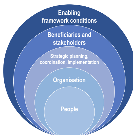
Figure 1. OECD Analytical framework for building administrative capacities in the use of EU funds

Source: Adapted from OECD (2020), Strengthening Governance of EU Funds under Cohesion Policy: Administrative Capacity Building Roadmaps , OECD Multi-level Governance Studies, OECD Publishing, Paris, https://doi.org/10.1787/9b71c8d8-en .