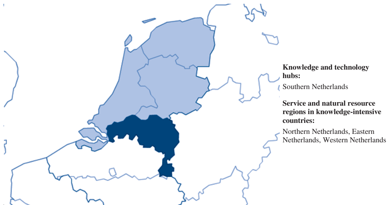
Figure 7.26. Categorisation of OECD regions in country

Note: Colours range from dark to light based on the type of region present in the country with available data. This map is for illustrative purposes and is without prejudice to the status of or sovereignty over any territory covered by this map.