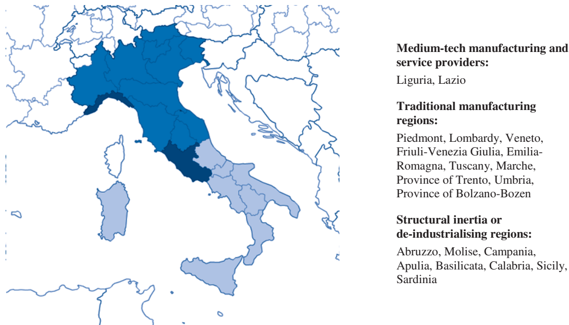
Figure 7.20. Categorisation of OECD regions in country

Note: Colours range from dark to light based on the type of region present in the country with available data. This map is for illustrative purposes and is without prejudice to the status of or sovereignty over any territory covered by this map.