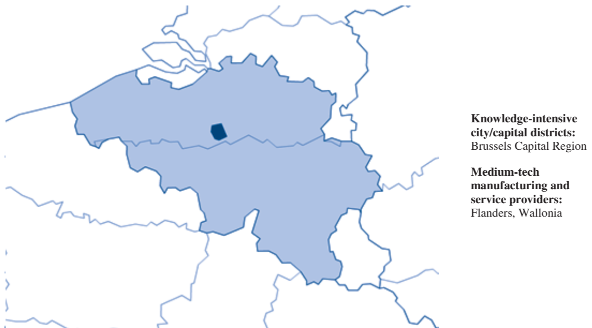
Figure 7.4. Categorisation of OECD regions in country

Note: Colours range from dark to light based on the type of region present in the country with available data. This map is for illustrative purposes and is without prejudice to the status of or sovereignty over any territory covered by this map.