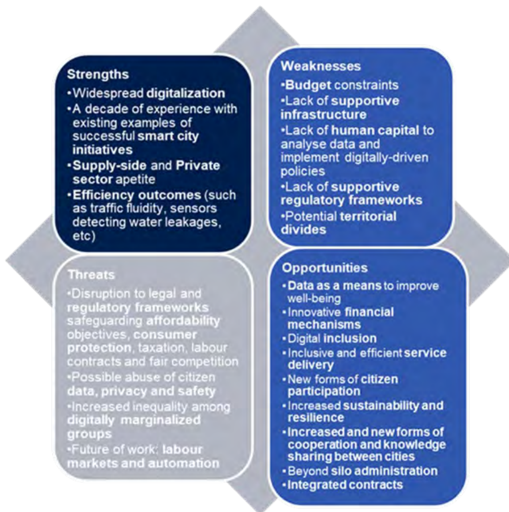
Figure 1. SWOT analysis of smart city initiatives in OECD countries

Measuring the performance of smart cities is therefore essential to ensure their effectiveness. With the COVID-19 crisis severely crunching municipal budgets, it is more critical than ever to devise cost-effective solutions to deliver public services. Assessing smart city performance also helps ground policy intervention in solid evidence by guiding decision makers, both at national and local levels, in setting realistic targets, understanding where cities stand vis-à-vis their objectives, tracking progress and adjusting policy interventions for greater efficiency and effectiveness. Ultimately, smart city measurement enhances accountability and helps citizens monitor how governments deliver on their commitments. In this respect, measuring smart city performance is a way to implement Principle 11 of the OECD Principles on Urban Policy, which were welcomed by mayors and ministers of urban policy across OECD countries in March 2019: “Foster monitoring, evaluation and accountability of urban governance and policy outcomes”. 1