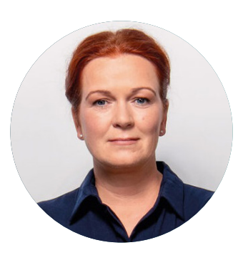
Katja Dörner Mayor City of Bonn Germany