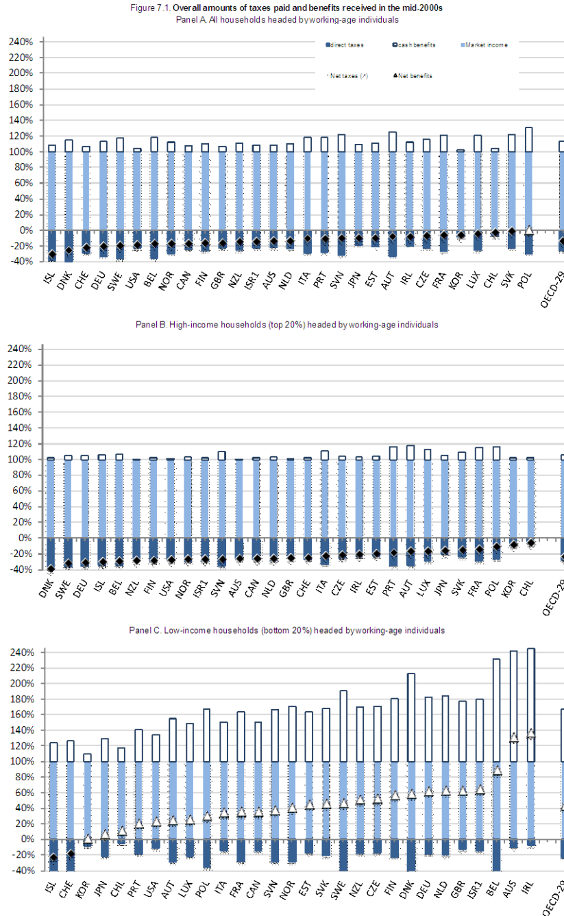
Figure 7.1. Overall amounts of taxes paid and benefits received in the mid-2000s

Note: Countries are ranked by the impact of the redistribution system on household income, i.e., by net taxes (taxes minus benefits). Information on data for Israel: http://dx.doi.org/10.1787/888932315602 .