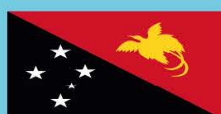
Papua New Guinea