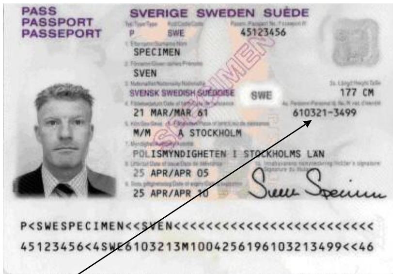
Personal Identification Number (TIN)