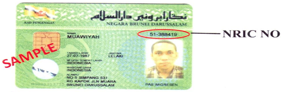
TEMPORARY RESIDENT OF BRUNEI