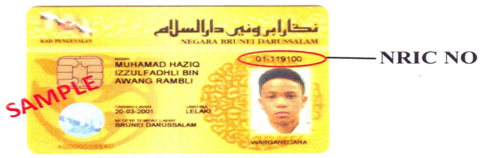
CITIZEN OF BRUNEI