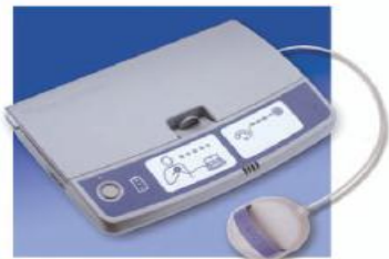
Medtronic CareLinkモニター及びアンテナ