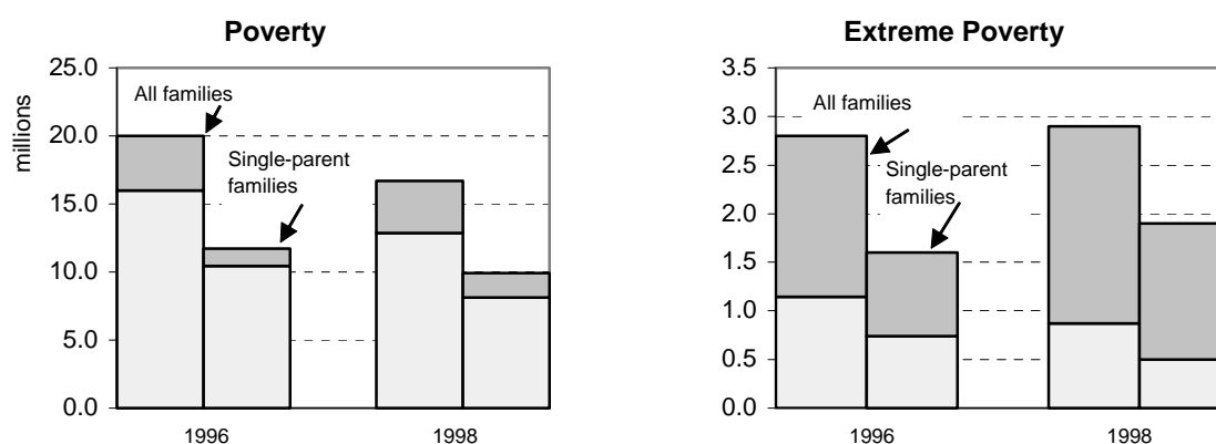
Figure 1. Number of people in families with children living in poverty and extreme poverty in the United States, under alternative assumptions about take-up rates of welfare benefits

Note: The height of the bars indicates the number of people living in families with children counted as “poor” or “extremely poor” in the two years shown. The dark part of the bar indicates the reduction in the number of poor people that could be achieved if all those entitled to benefits (food stamp, Supplementary Security Income, and Temporary Assistance for Needy Families) took full advantage of them. Poverty is here measured with reference to a broad notion of “household disposable income”, which includes all government assistance and deducts federal payroll and income taxes, as well as out-of-pocket childcare expenses. Poverty is measured with reference to the federal poverty threshold. Extreme poverty is defined as income below 50% of the federal poverty level.