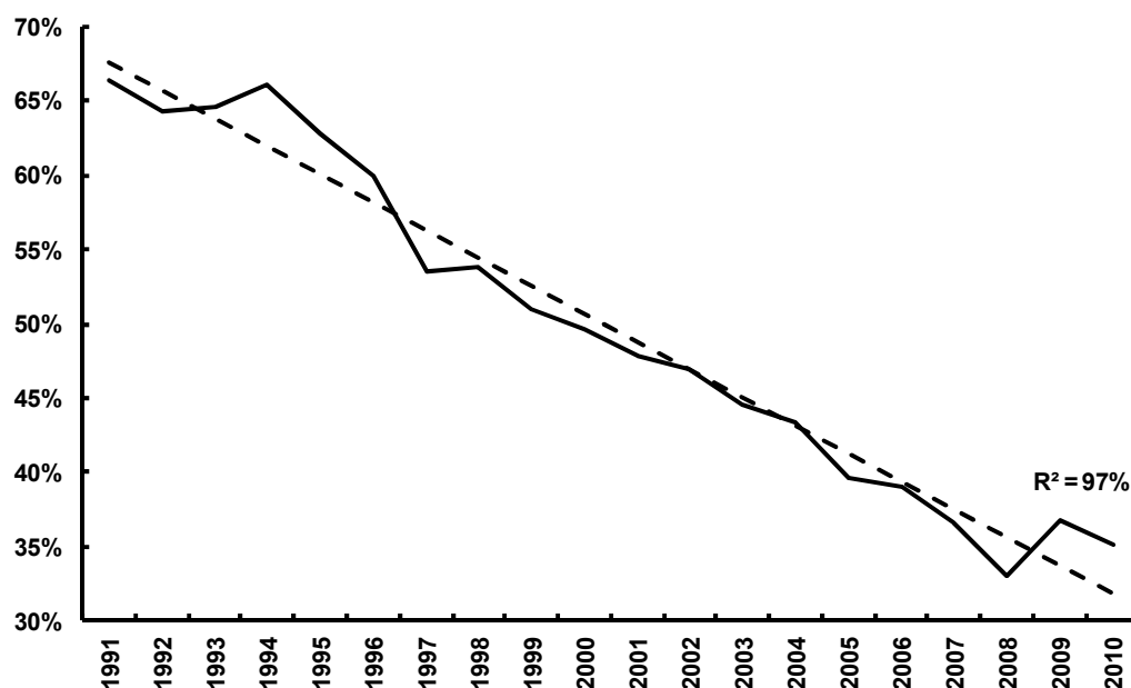
Figure 1. Historical development of the RWA/TA ratio of systemically important banks

Source: The Banker Database, Author's calculations and estimates, See Appendix 1. For a similar chart for selected individual banks, see Figure 14 in Blundell-Wignall and Atkinson (June 2011).