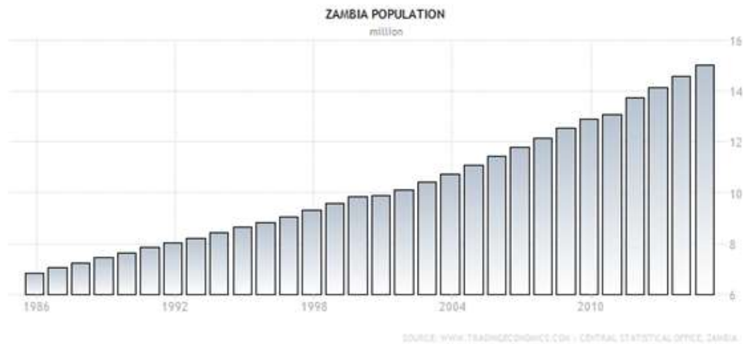
Fig 1: Zambia population

4. The total population in Zambia was last recorded at 15.0 million people in 2014 from 3.1 million in 1960, changing 388 percent during the last 50 years. Population in Zambia averaged 7.70 million from 1960 until 2014, reaching an all-time high of 15.02 million in 2014 and a record low of 3.08 million in 1960. The population of Zambia represents 0.20 percent of the world's total population which arguably means that one person in every 518 people on the planet is a resident of Zambia.