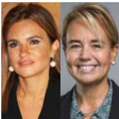
The Co-chairs of the Women's Economic Empowerment Forum: H.E. Sahar Nasr, Minister of Investment and International Co-operation, Egypt (left) and H.E. Marie-Claire Swärd Capra, Ambassador of Sweden to Algeria (right).

To support MENA countries in tapping the considerable potential of women to generate strong and inclusive growth, the MENA-OECD Competitiveness Programme launched a new Women's Economic Empowerment Forum on 7 October 2017 in Cairo, Egypt, under the aegis of H.E. Sahar Nasr, Minister of Investment and International Co-operation of Egypt and H.E. Marie-Claire Swärd Capra, Ambassador of Sweden to Algeria. The Forum was held in conjunction with the release of a groundbreaking OECD publication on Women's Economic Empowerment in Selected MENA Countries: The impact of legal frameworks in Algeria, Egypt, Jordan, Libya, Morocco and Tunisia .