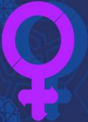
Female tertiary enrollment ratios (% gross)

Gender parity is not only a fundamental human right but also a critical economic opportunity for countries. Equating worldwide labour force participation rates of women to their male counterparts could increase global GDP by +26% by 2025. It is estimated that gender-based discrimination in social institutions represents a cost of USD 575 billion for the MENA region.