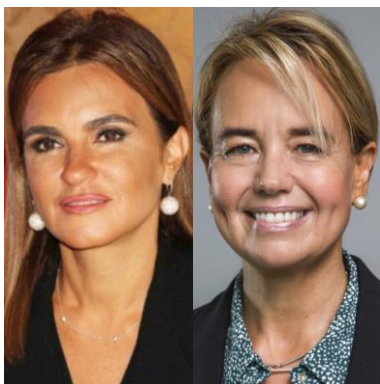
The Co-chairs of the Women's Economic Empowerment Forum: H.E. Sahar Nasr, Minister of Investment and International Co-operation, Egypt (left) and H.E. Marie-Claire Swärd Capra, Ambassador of Sweden to Algeria (right).

To support MENA countries in tapping the considerable potential of women to generate strong and inclusive growth, the MENA-OECD Competitiveness Programme will launch a new Women's Economic Empowerment Forum on 7-8 October 2017 in Cairo, Egypt, under the aegis of H.E. Sahar Nasr, Minister of Investment and International Co-operation of Egypt and H.E. Marie-Claire Swärd Capra, Ambassador of Sweden to Algeria. The Forum will be held in conjunction with the release of a ground-breaking OECD publication on Women's Economic Empowerment in Selected MENA Countries: The impact of legal frameworks in Algeria, Egypt, Jordan, Libya, Morocco and Tunisia .