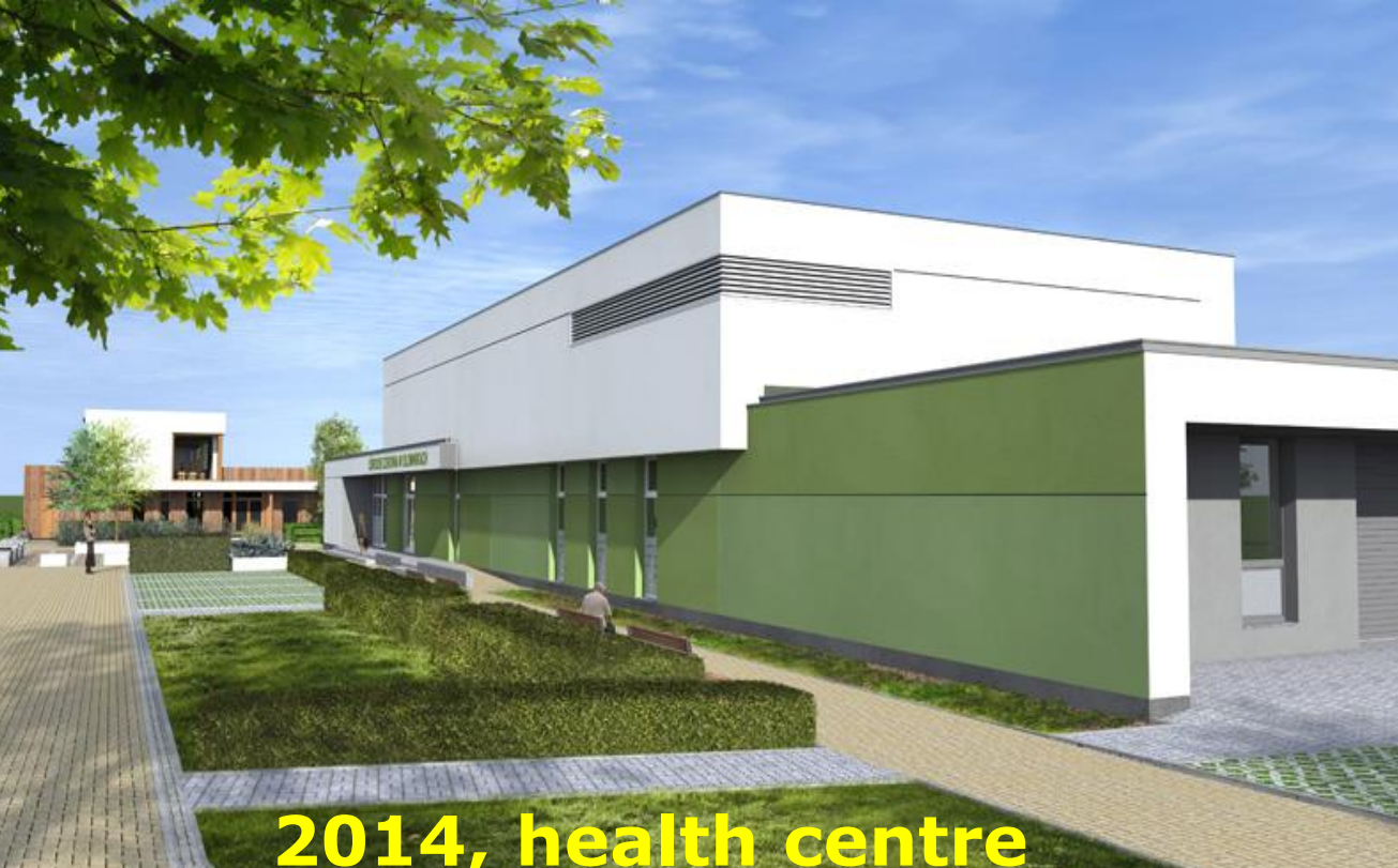
2014, health centre