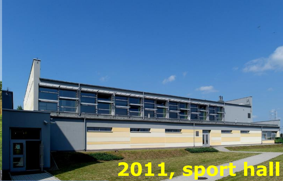
2011, sport hall