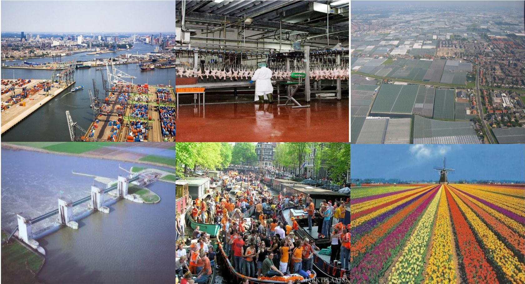
Logistics, Agrofood, Water, Entertainment, Agriculture