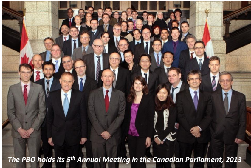
The PBO holds its 5 th Annual Meeting in the Canadian Parliament, 2013

Agendas and documents for PBO meetings are available at: www.oecd.org/gov/budget/pbo