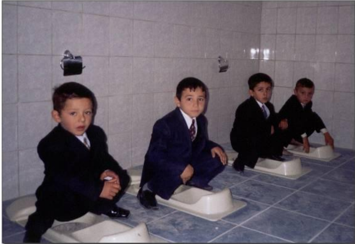
Training Course on Ecosan in pilot village Hayanist, Armenia