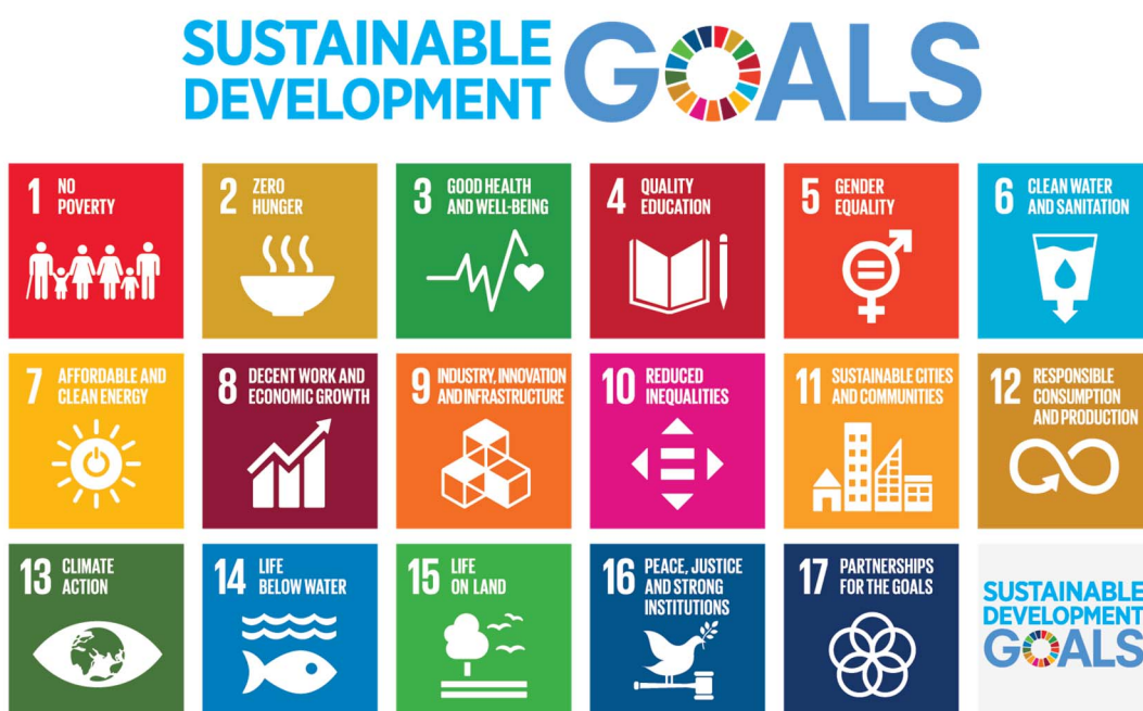
Figure 1. The 17 Sustainable Development Goals or SDGs (UN, 2017)

Building on the outcomes of the meeting, this policy note provides an overview of current perceptions, ongoing strategies and suggestions to further optimise the private sector’s contribution to the SDGs. Furthermore, some case studies provide evidence on how businesses are currently contributing to the SDGs and trying to combine sustainability with profitability.