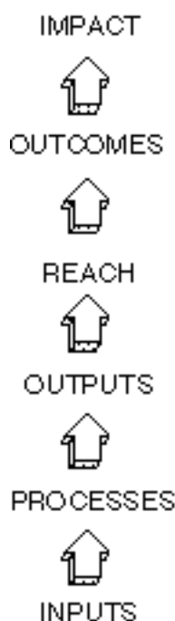
Figure 2: Results chain for development activities impact

projects – measuring and evaluating their inputs, processes, outputs and outcomes. The performance of development activities at these levels helps to determine overall success in reducing poverty.