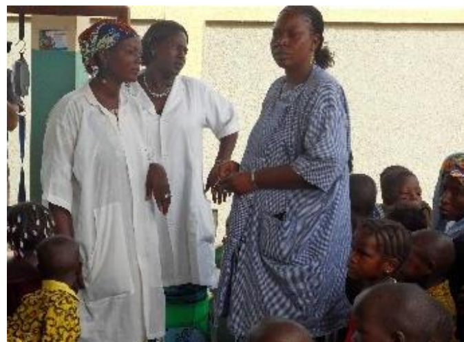
Staff and community members at a health centre in Mali (EC, 2010) The evaluation concluded that reforms and related investments from budget support produced significant outcomes in health.

In Zambia, substantial investments were recorded in some major economic sectors, but efforts to improve opportunities in the rural economy were insufficient. Budget support provided a limited contribution to the macro-economic policies. These were mainly driven by other factors (export prices, debt relief). In agriculture, the financial contribution provided by general budget support has financed doubtful subsidy policies, about which there are significant divergences of opinion between government and donors.