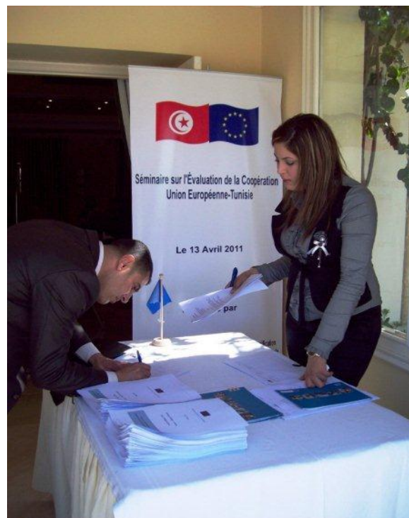
A representative of the new Tunisian government at a workshop with the EC, EU member states, other donors and non-state actors to discuss the evaluation results (April 2011)

In Tunisia, budget support has been particularly effective in supporting important economic reforms (trade liberalisation and taxation, financial sector restructuring, competition policies) and education reforms, which were given top priority in the previous government's agenda and were supported by Tunisian enterprises and citizens generally. Indeed, the Tunisian case shows that commitment by government and people were positively affected and enhanced by the Association Agreement with the EU (signed in 1995), which opened up new opportunities for accelerated growth and integration. The partnership agreement contributed to galvanising the commitment of the government, while budget support played an important role in facilitating and assisting reform implementation.