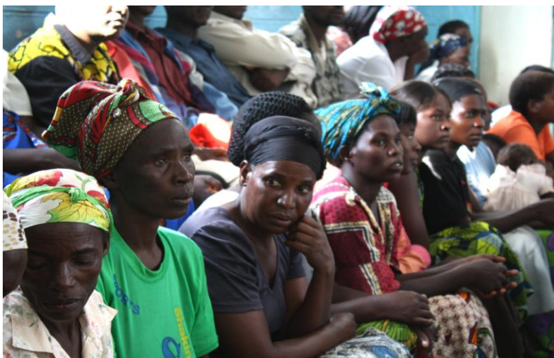
Women participate in a focus group discussion in Kalomo District during the evaluation study visit in Zambia (Hans de Voogd, 2010)