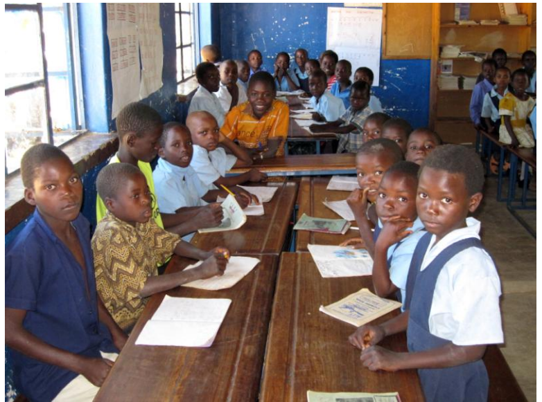
Students at Chilenga basic school during a visit of the evaluation team in Chadiza, Zambia (Antonie de Kemp, 2010) The study found that budget support increased government spending on education.

Adapted design of the programmes and flexible use of general and sector budget support: In all three countries the operational design was mostly well-adapted to the specific local contexts. The choice between general support and sector-specific support has not affected how the instrument operates, nor directly its results. Success has mainly been a factor of the policy objectives adopted and the corresponding institutional framework.