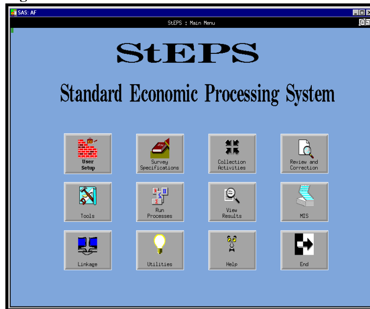
Figure 2: StEPS Main Menu

Menu selections walk users through various modules so knowledge of data set structures and location is not necessary. While an exhaustive review of each module cannot be discussed here, some key points about the modules are discussed below.