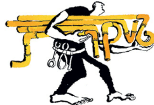
Illustration by Belle Mellor