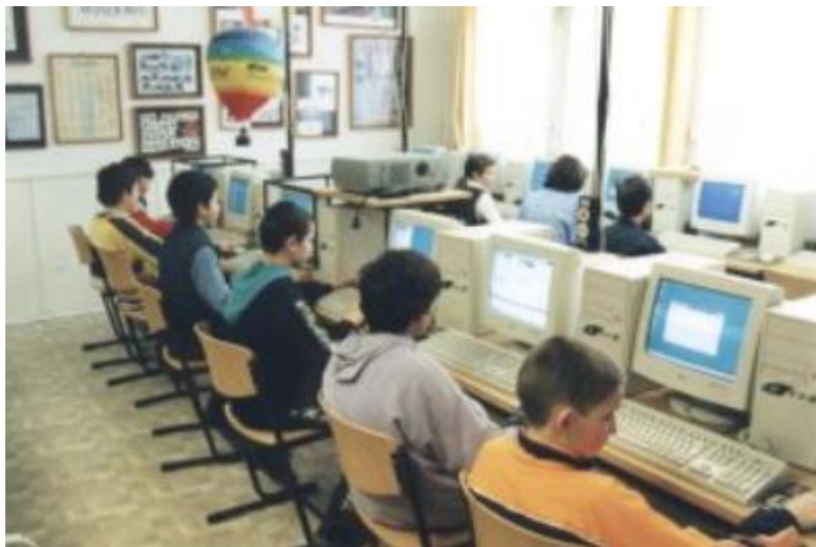
Picture 8: ICT lesson in progress

The Multimedia Circle run by the ICT teachers is a very popular free time activity where students acquire basic multimedia development skills.