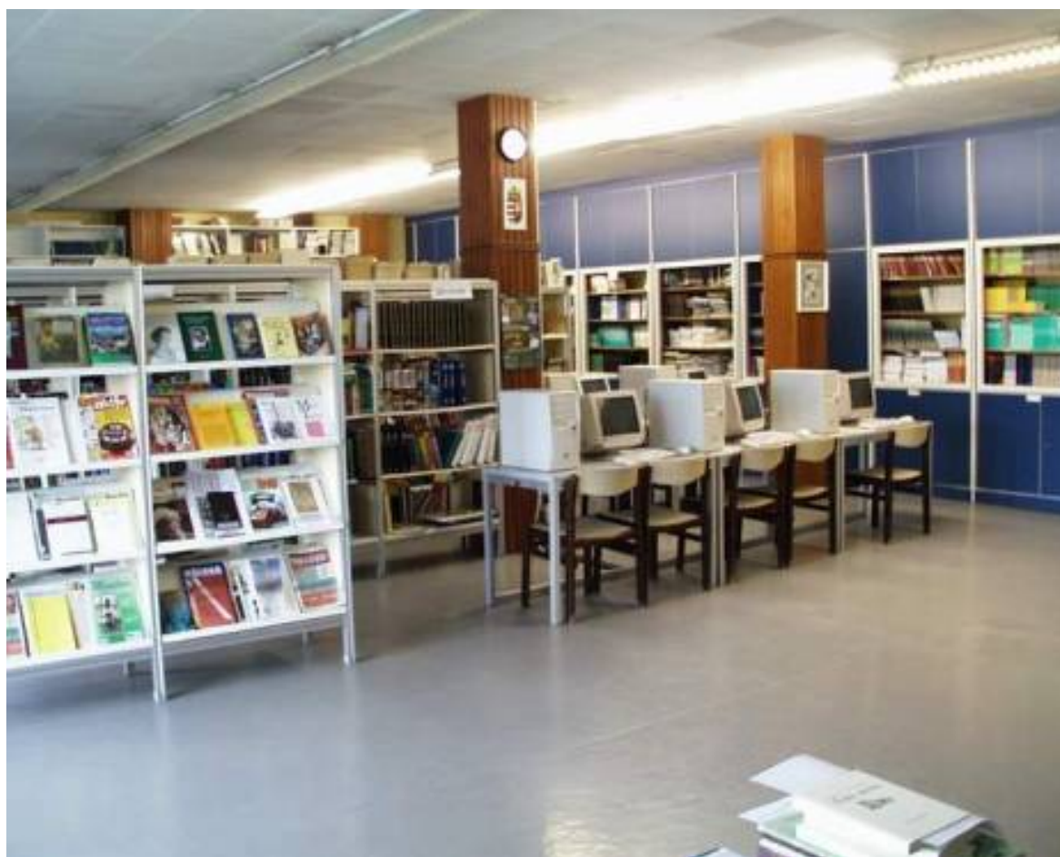
Picture 2: Students working on a bilingual project in the English Reference Library