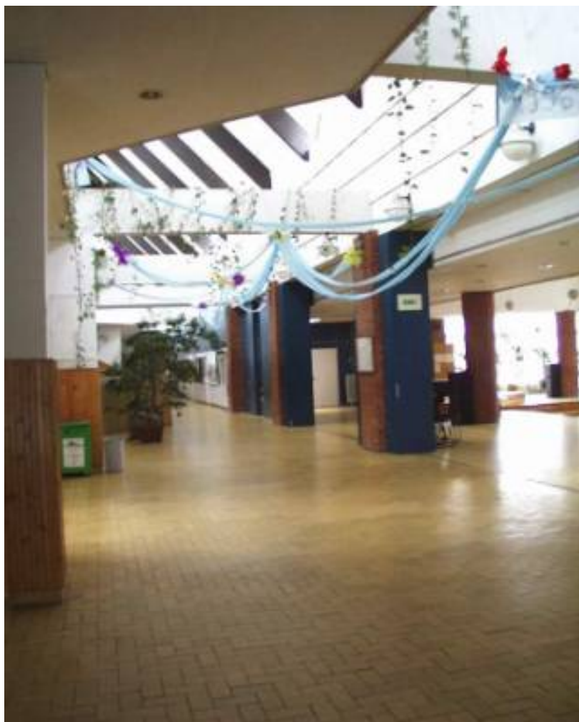
Picture 8: The spacious entrance area (aula) decorated for a school feast